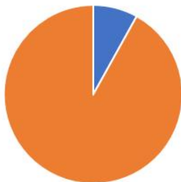
CEO Compensation Mix - 2020

The Compensation Committee concluded that for 2020 executive compensation reflected an appropriate mix of base salary, incentive bonuses, service-based equity compensation and performance-based equity compensation that provides sufficient retentive and motivational value to align the interests of executives with our Stockholders.